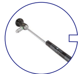
Lap Scope WarmOR™

The Scope HelpOR™ reduces the need to cleanse the scope lens throughout the surgery, which results in improved visibility, less surgical interruption, and therefore fewer procedure delays.