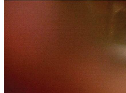
Without Scope HelpOR™ - Fogged view