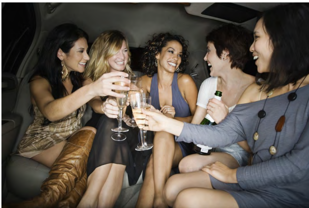
Some parties last well into the next morning.

“Maybe people feel it’s easier to cut loose. They are having a getaway, they do not have to think about returning home at the end of the evening,” Yeung says.