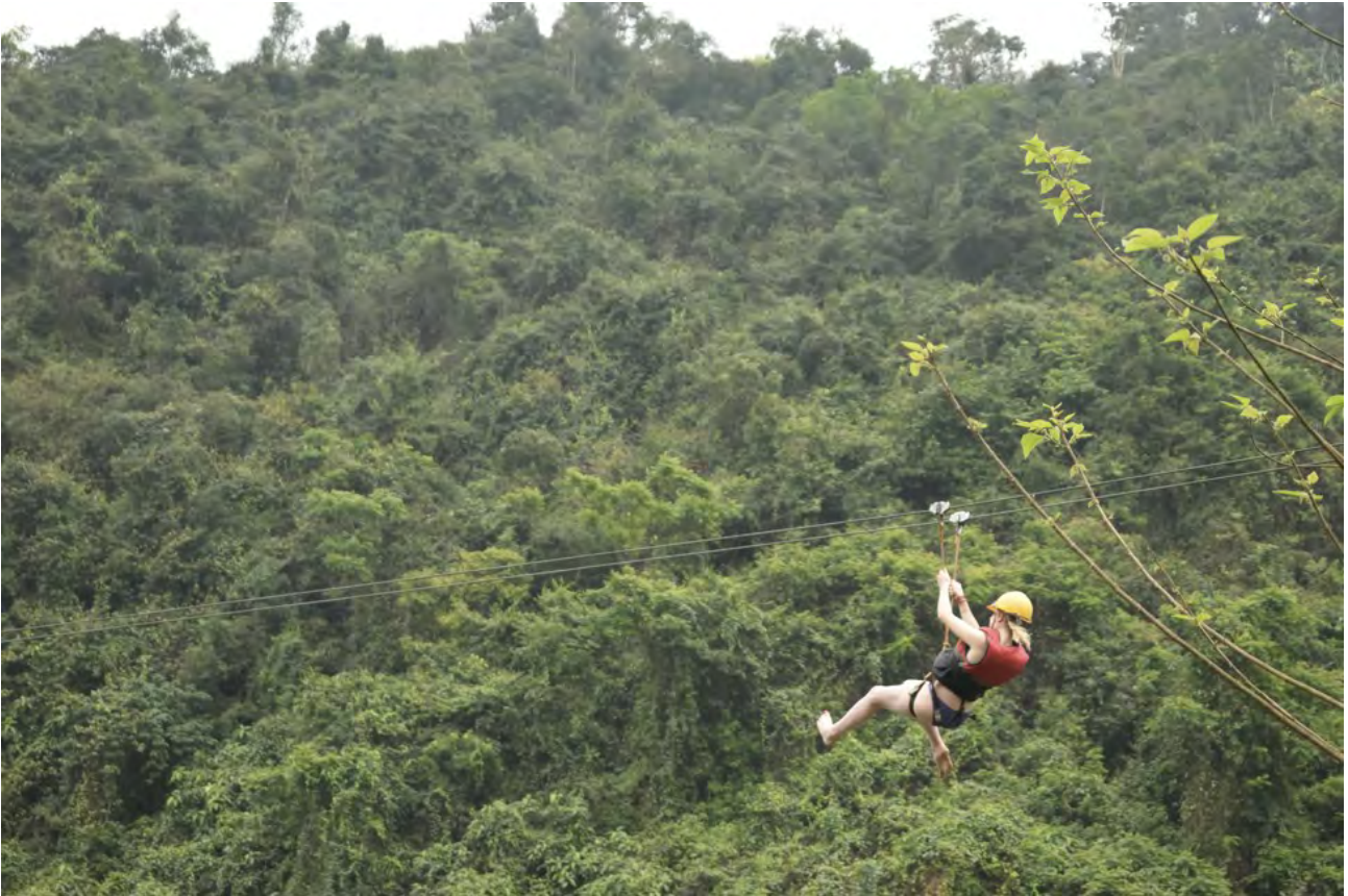
Zip lining in Vietnam.

Destinations that promise top local gastronomy experiences – such as Okayama in Japan, where you can join in with fruit harvesting and get a taste of the local culture – are also seeing more interest.