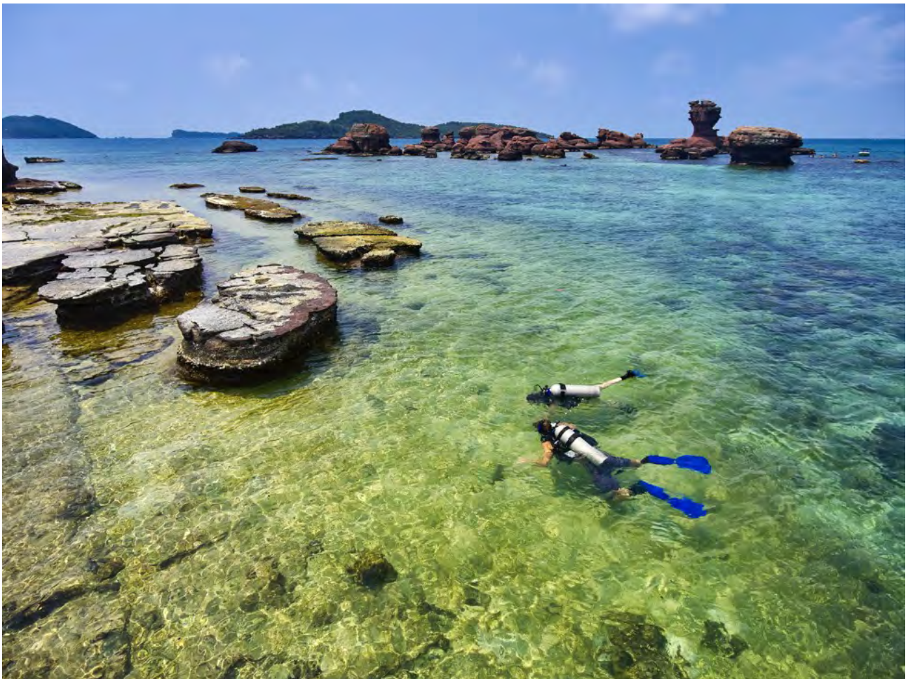
Phu Quoc island is great for diving.

“Sometimes the party can last the whole day,” Yeung says. “I heard of [a stag party] recently that went from 10am all the way through until the next morning.”