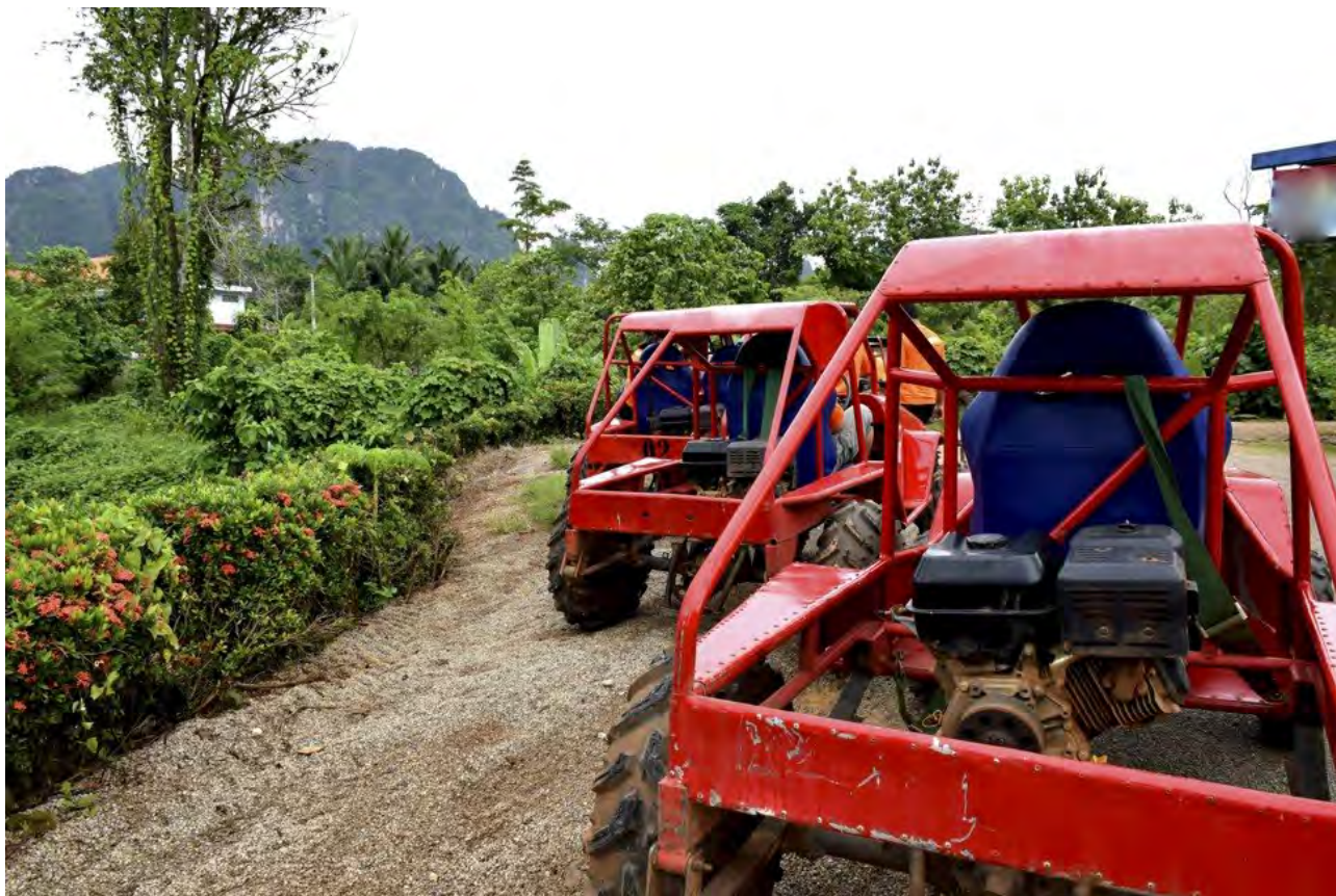
Krabi is a popular place to head to for ATV experiences.