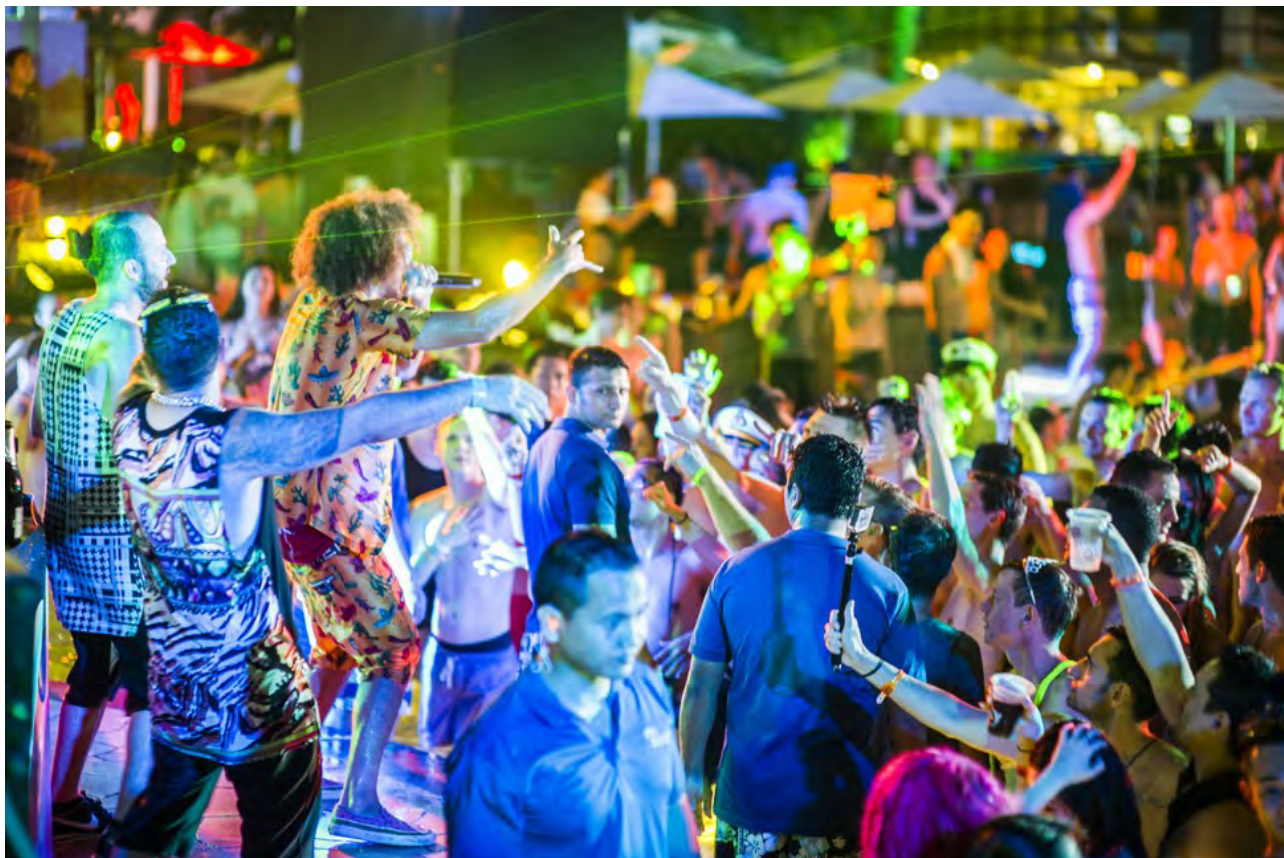
Macau has a good party scene for when you're finished at the casinos.

“You want to pick a place where there are things to do to celebrate the occasion [like] lots of group activities available,” Yeung says. “In Singapore, you can go for cocktails at the Raffles, there are lots of nice restaurants and then on to a bar or club. Bali is popular for a great beach or spa where you can chill out.”