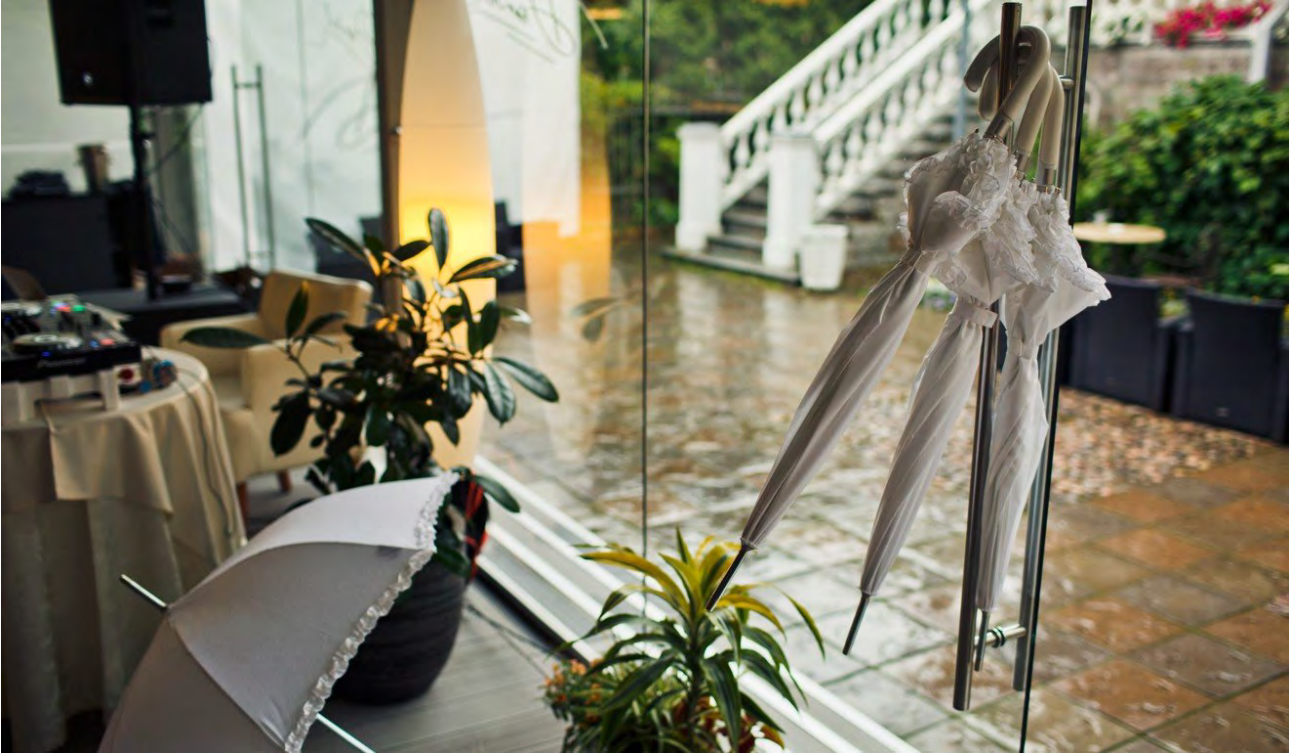
Wedding planners try to prepare for the unexpected.

The couple kept it a very intimate affair and the witness was the reverend's photographer. "He took the most underwhelming wedding photos you've ever seen. Thankfully we went through with it and 25 years on we're still yelling at each other in scenic places," says Greg.