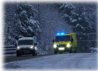
Emergency Vehicle Warning