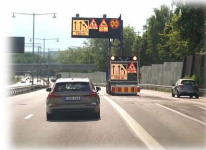
Road Works Warning