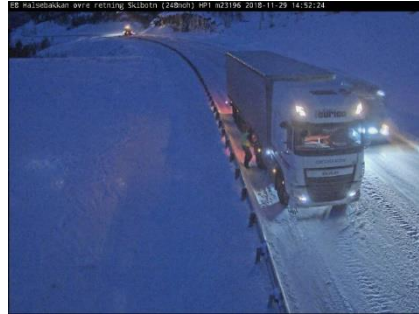
Approx 40 miutes later it is time to put on show chains