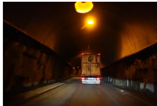
Tunnels where truck have to drive in the middle to fit