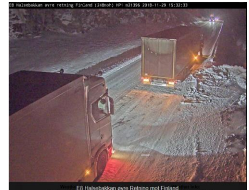
The more the merrier – joined after 20 minutes