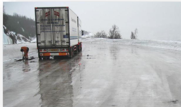
Figuring out how to put on snow chains – and yes it is solid ice with water on top