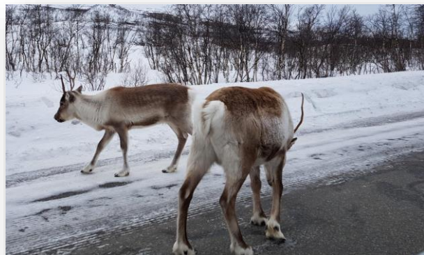
Salt to remove ice also attracts the locals