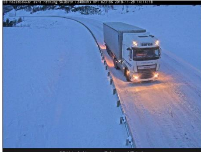
Two axel trucks and snow is a poor combination