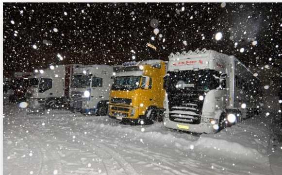
Waiting out a storm at the local gas station in Skiboten