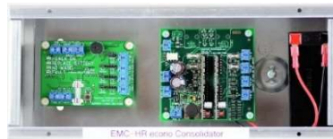
EMC-PAC + EMC-LR = EMC-HR