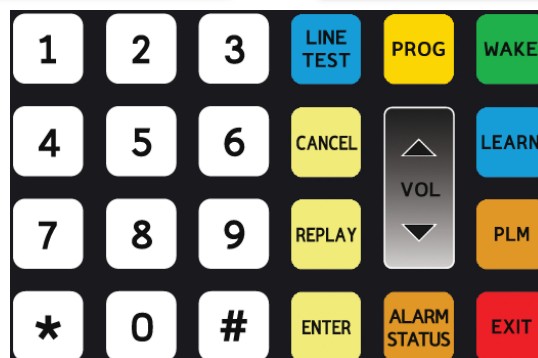
24 button touch keypad

Customer Care: Call 1-844-EMERCOM (1-844-363-7266) for assistance.