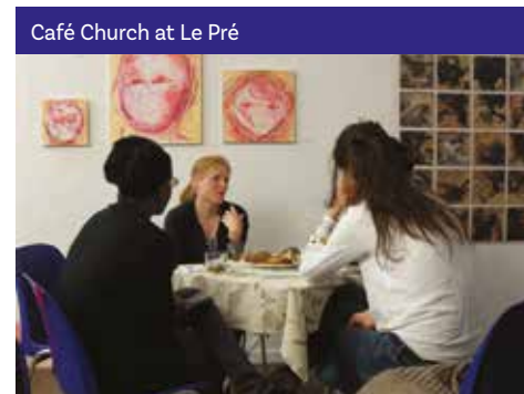
Café Church at Le Pré