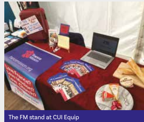
The FM stand at CUI Equip