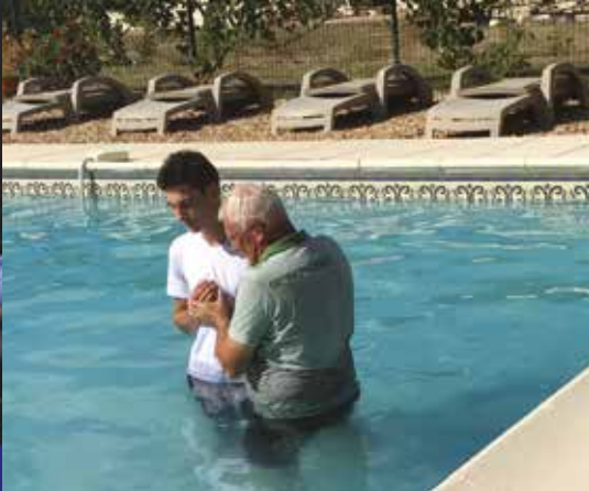
A baptismal testimony