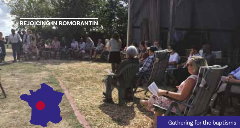
Gathering for the baptisms