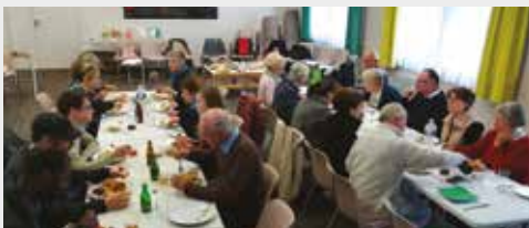
English Conversation group lunch with friends from Yeovil

It's still very much our hope that there will