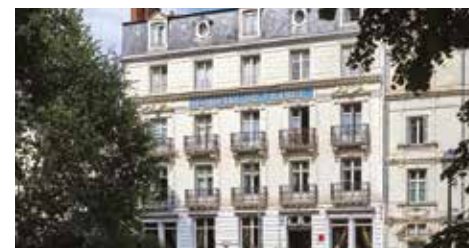
Hotel used for Sunday Gatherings

Please pray for a smooth transition, and for energy and perseverance in the months ahead. Pray that, both through the Sunday Gatherings and through the gallery we use as a base for public contact, Jesus would