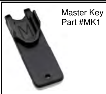
Master Key Part #MK1