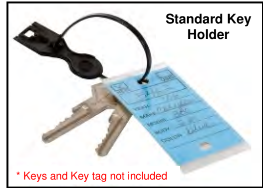
Standard Key Holder