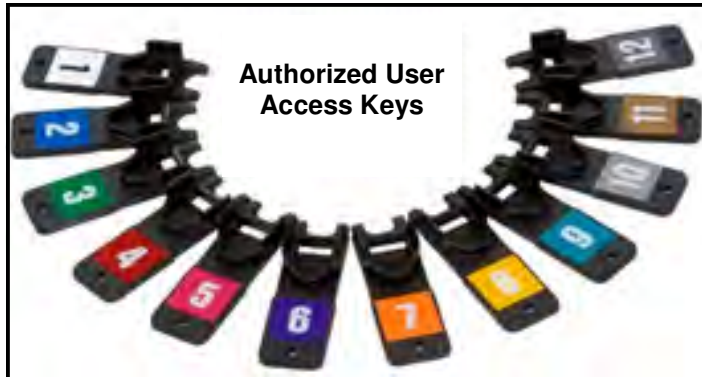
Authorized User Access Keys