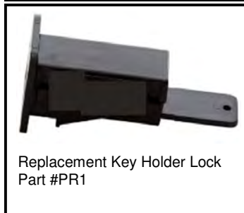
Replacement Key Holder Lock Part #PR1