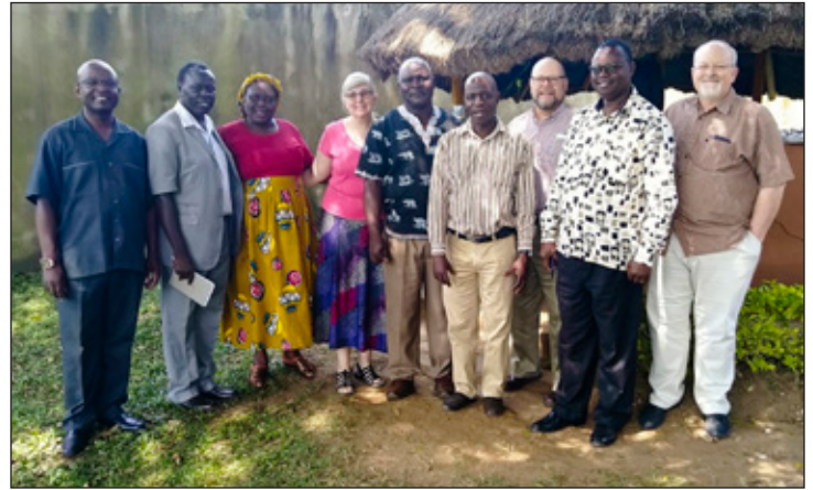
The first meeting of the FUM Missions Committee, in January 2020.