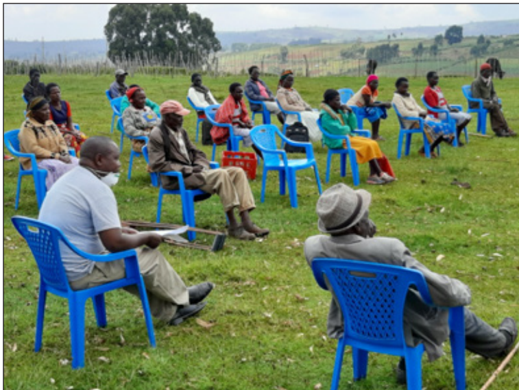
Families on Kenya's Mt. Elgon observe social distancing while waiting for food distribution from Friends Church Peace Team, funded by FUM's COVID-19 Solidarity Fund.

FCPT trauma counselors will distribute the food assistance in a way that complies with government protocols for social distancing. They will be accompanied by a health officer from the local administration, who will discuss with the family what steps they are taking to stay safe from the virus. Please pray for these twenty-five families, and those who are assisting them, that they would remain healthy and would have enough to eat during this difficult time.