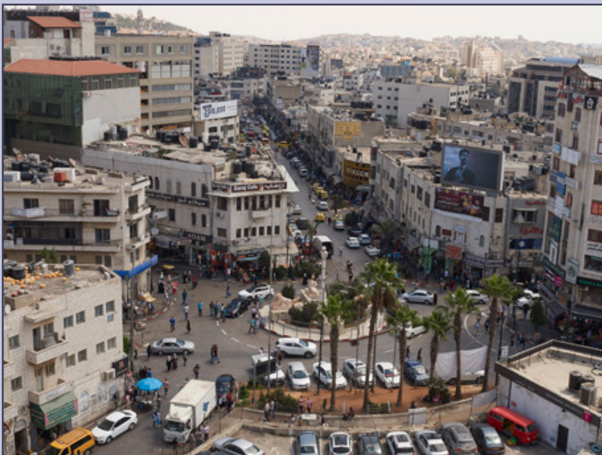
The Ramallah city center.

The Learning Support program at RFS has adopted an inclusive philosophy from its beginning. Inclusion is a value that supports the rights of children, regardless of their diverse abilities, to participate actively and naturally with others. Our school is proud to celebrate diversity by the inclusion of around one hundred students within the overall school community, students whose differences range from physical difficulties such as palsy, visual impairment, hearing impairment, to general learning difficulties, specific learning difficulties (dyslexia, dyspraxia), ADHD, autistim spectrum disorders, Kabuki syndrome, and Down Syndrome.