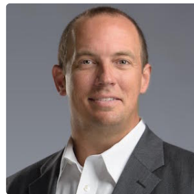
Jack Born Deadline Funnel https://deadlinefunnel.com