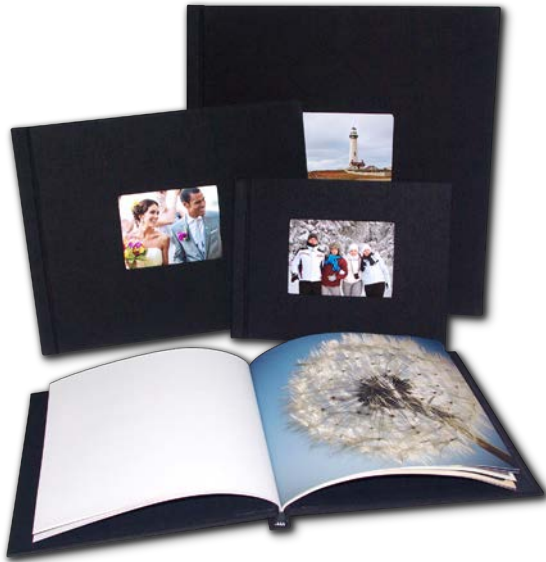
Photo books available in two styles. Prestige Single Sided Books with Premium Paper or our original Double Sided Everyday Books. Use one or multiple photos per page. Add extra pages as you need them ^ . Add text and themes. Our books are a hard cover solution with a window cut through for your front page photo to show through. Printed sheets are stapled along the left edge to stabilise the books page block before insertion into special Pinchbook™ covers which allow additional sheets to be added later. Order online (no software needed) or order in store on one of our kiosks.