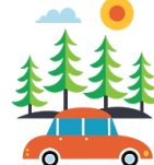
I will only operate a motor vehicle where permitted.