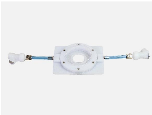
Figure 1. Inverted StageFlexer® microscopy strain device.

Flexcell®'s Inverted StageFlexer® (Fig. 1) can be used in conjunction with the FX-6000™, FX-5000™, or Flex Jr.™ tension systems to observe cell stretching activity with an inverted objective microscope. Cells are grown on a 54 mm diameter silicone elastomer membrane (Inverted StageFlexer® Membrane, growth surface area = 23 cm 2 ), which is clamped and sealed to a cylindrical vacuum chamber. When vacuum is applied, the membrane translates across the chamber circumference, applying strain to the cells on the membrane surface (Fig. 2). The membrane deformation results in application of uniform, equibiaxial strain to the cells (Fig. 2).