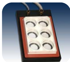
Figure 27. Single plate baseplate.