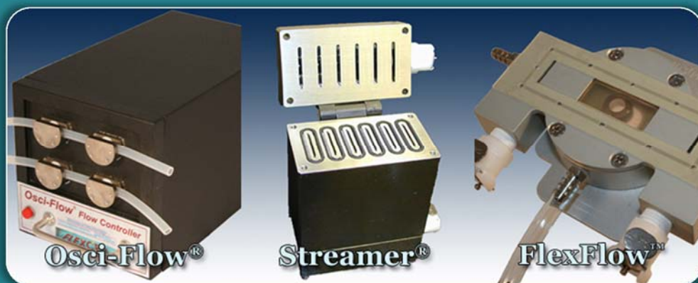
Flexcell® Fluid Flow Systems