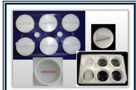
Figure 1. A) Arcangle® loading post. B) Well of a UniFlex® culture plate. C) UniFlex® culture plate atop an Arcangle® Loading Station™.

6-place linear Trough Loaders™ (Cat. No. TT-4000TL) and trapezoidal Trough Loaders™ (Cat. No. TTTP-4000) can be purchased in a set of 4.