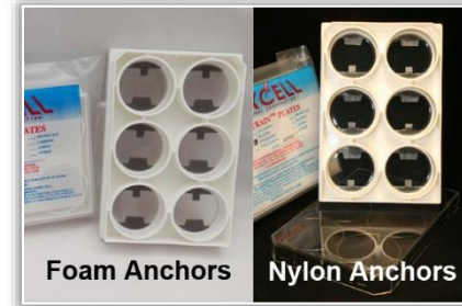
Figure 1. Trapezoidal Tissue Train® culture plates have six 35 mm wells with either foam or nylon anchors attached to the membrane in each well.