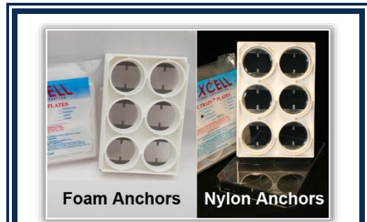
Figure 1. Linear Tissue Train® culture plates have six 35 mm wells with either foam or nylon anchors attached to the membrane in each well.