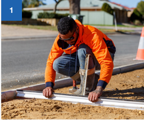
Position the Lock Joint™