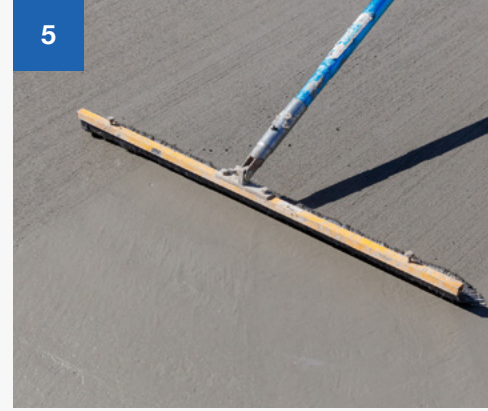
Bull float, trowel & brush finish