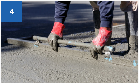
Screed & Remove Pegs