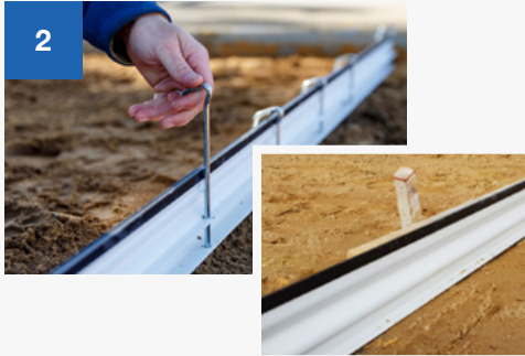
Insert Pegs or Backing Board