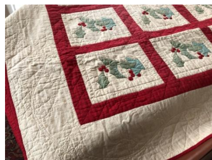
Holly quilt today