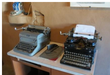
Do these typewriters look familiar?