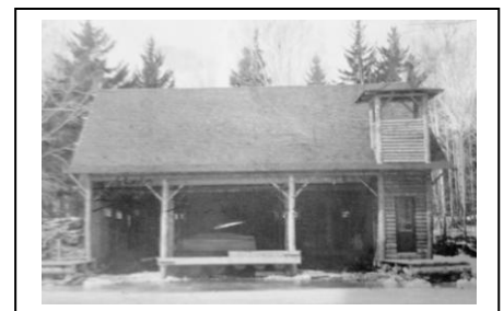
Colgate Boathouse, Fernwood Pt. c. 1910

All are welcome; admission is free (donations appreciated); refreshments.