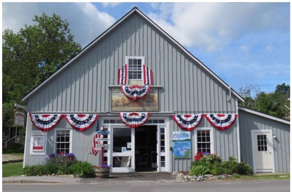
Flanders-Osborne Museum decked out for Sunapee's Sestercentennial (250 th ) Anniversary