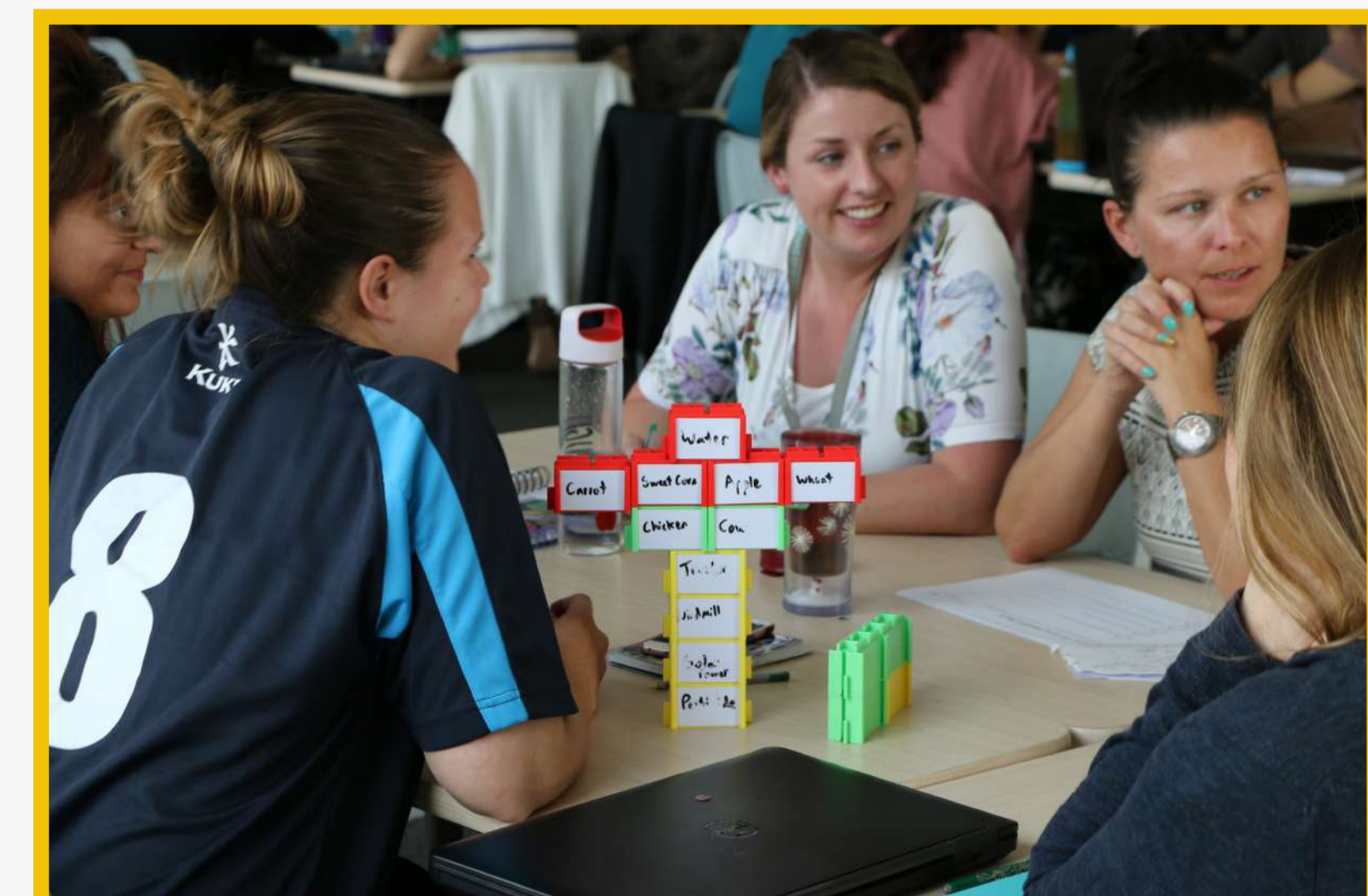
Raising the profile of cognition