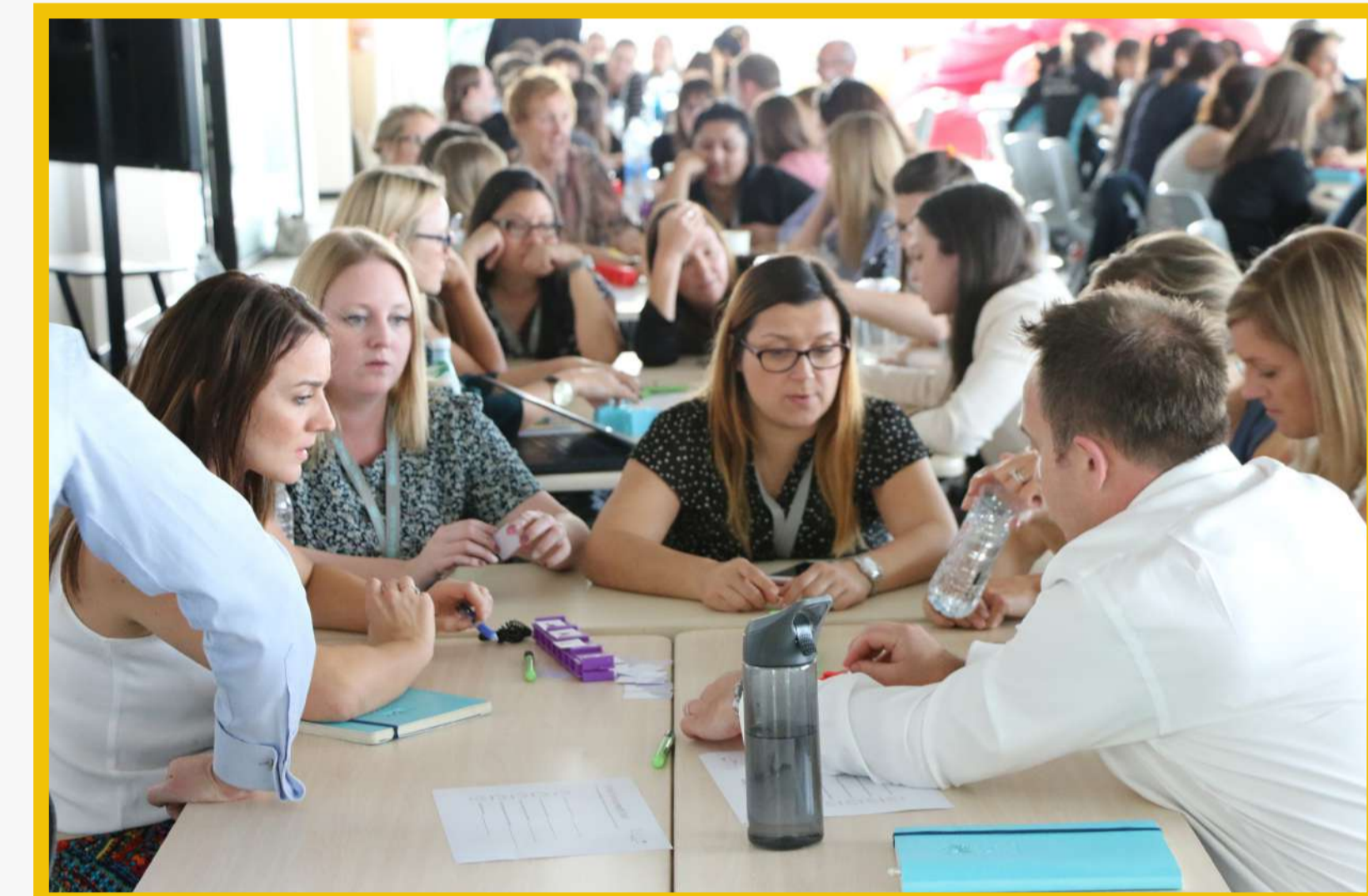
Building a shared vision of teaching and learning

Your colleagues will be facilitated through a collaborative process where they are given space to grapple with cognition and what it means in their classrooms. They will leave with practical evidence-informed ways to move ideas forward.