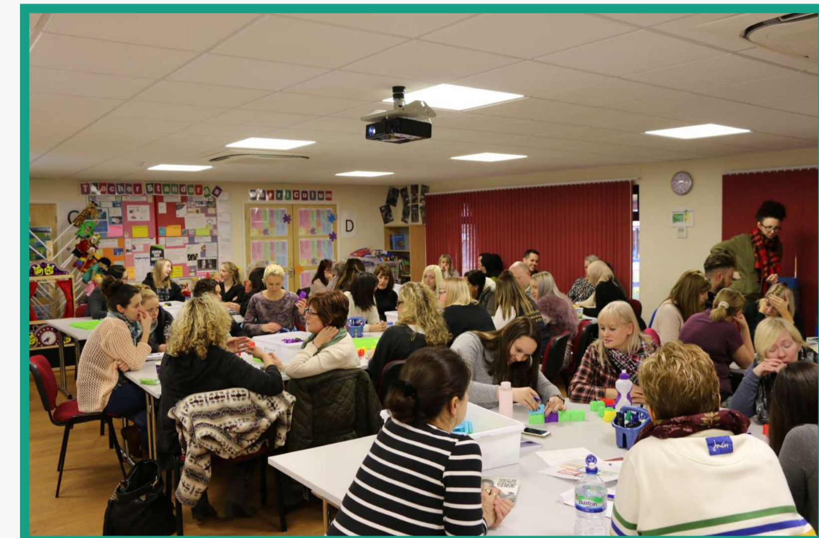
Digging deeper into the process of learning

Participants will enjoy a 'learning deep dive' where we reframe our classroom challenges through a cognitive lens. Changing our perspectives can be the catalyst we need to move practice forward. Your staff will also receive a toolkit of new ideas and resources to compliment their newly acquired skills.