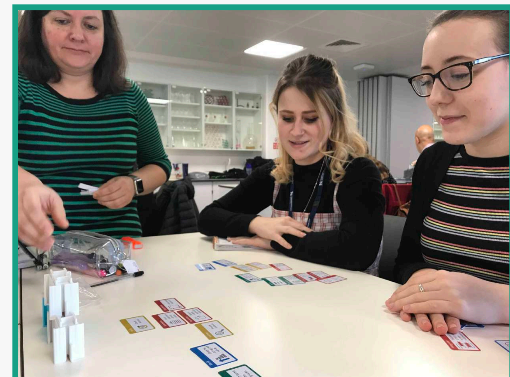
Develop new skills and approaches