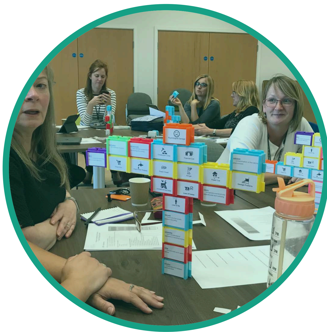
Workshops on Metacognition and Critical Thinking.