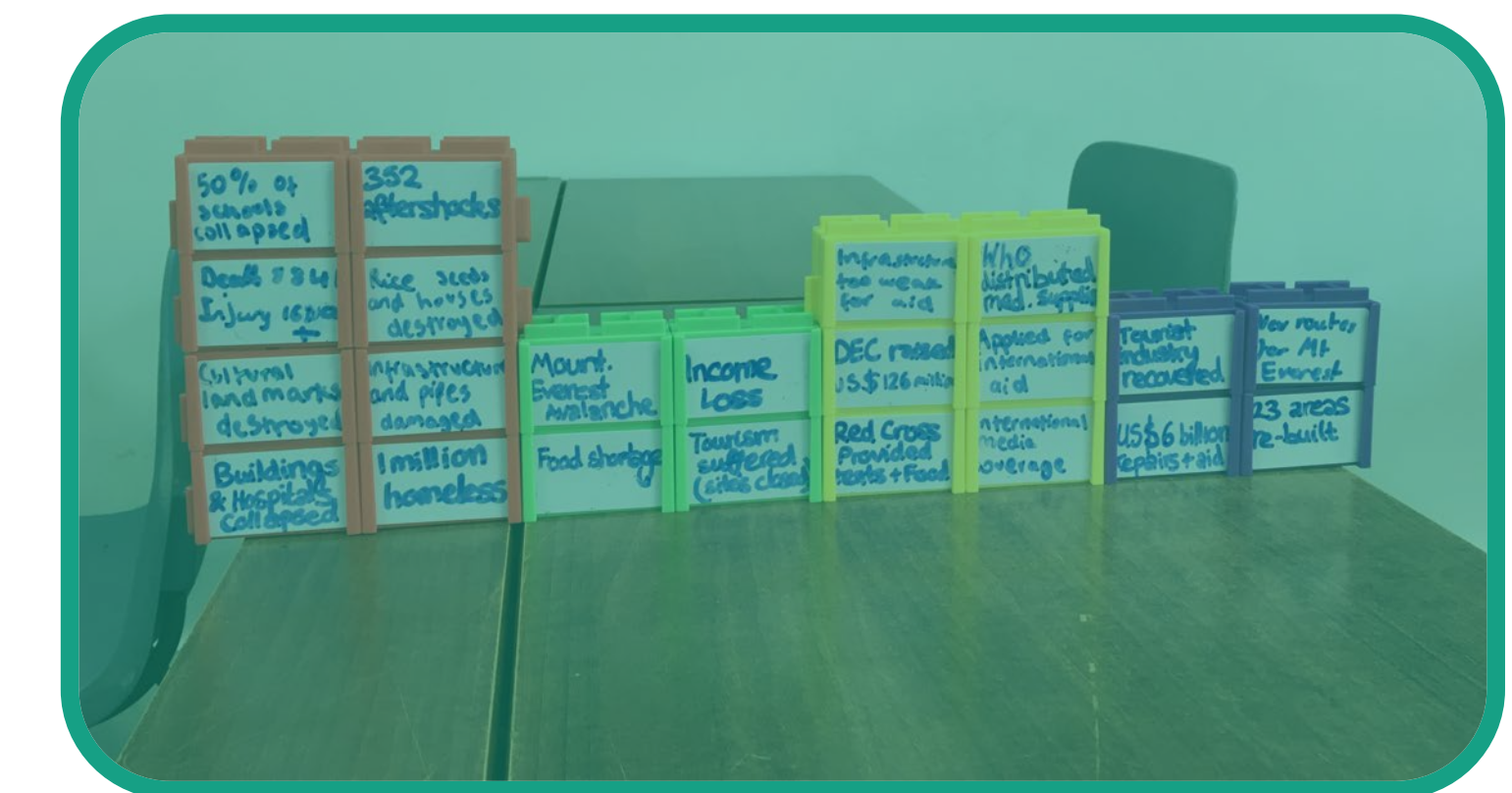
Geographical events sequenced together.