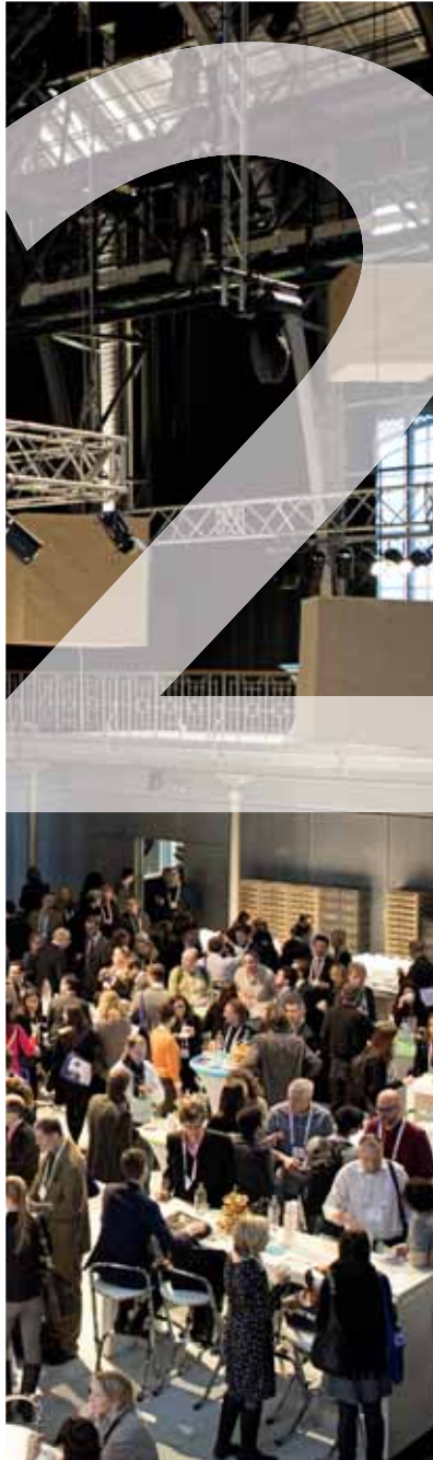
Coffee Breaks, Lunch and Cocktails will be served in Le Village, which is located in the Grande Halle