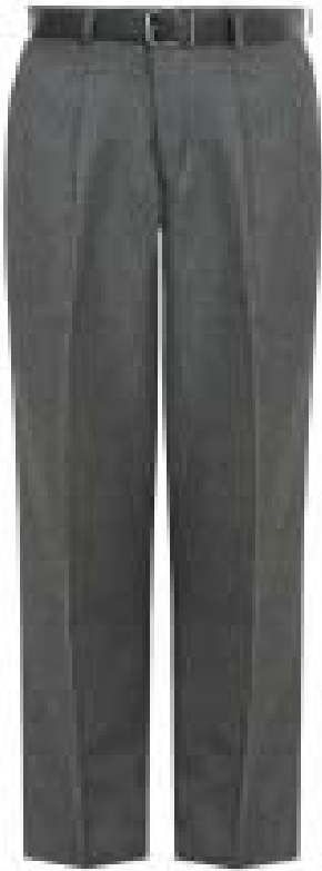
Trousers - Plain grey school-type trousers with a slim black belt.