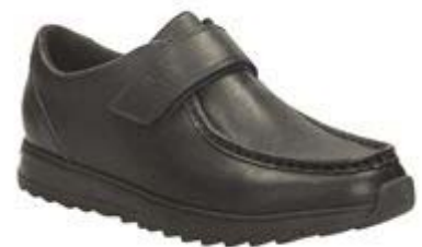
Shoes - Plain black leather or leather-look school shoes with no logos or brand names.