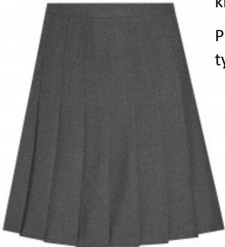
Trousers/Skirt - Grey pleated, straight or A-line skirt. Approximately knee length. Plain grey school- type trousers.