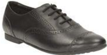
Shoes - Plain black leather or leather-look school shoes with no logos or brand names.