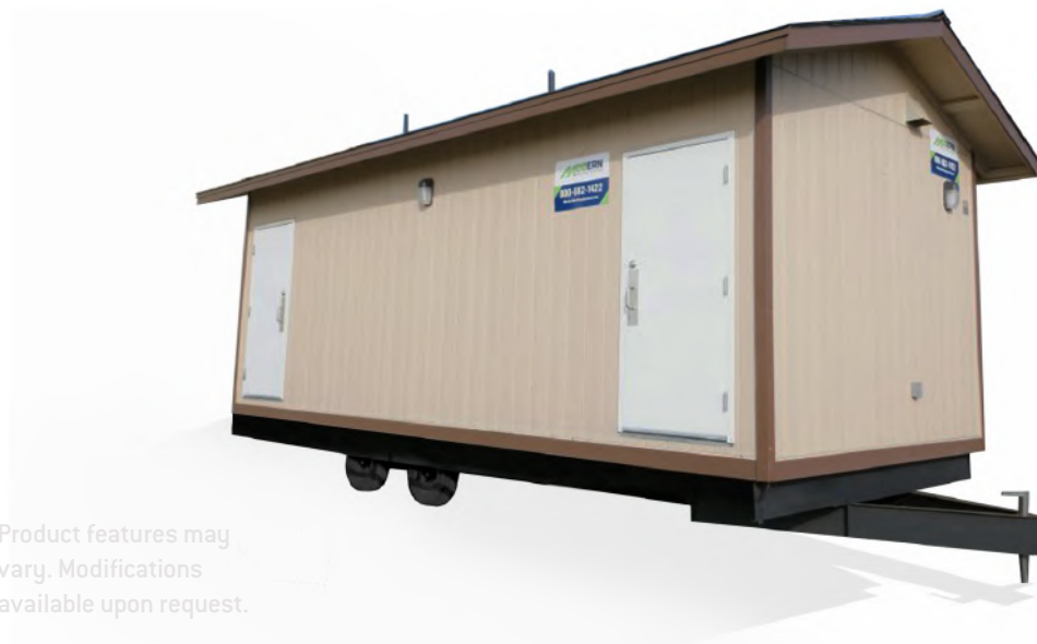
Product features may vary. Modifications available upon request.