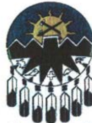
TREATY No. 7