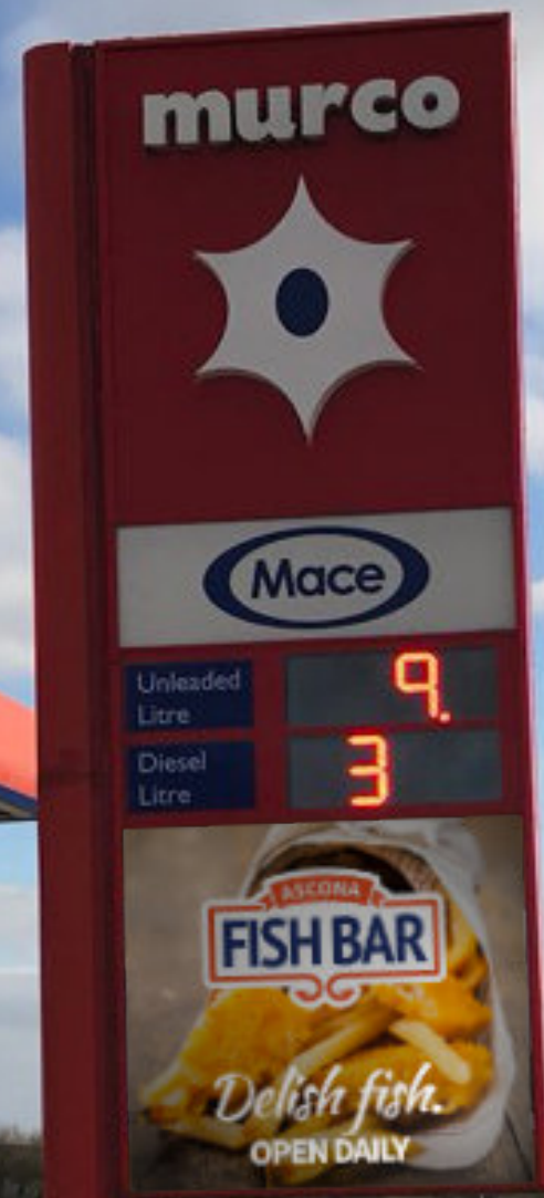
Pelcombe Service Station Pump Price Sign Advert