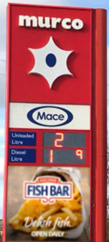
Pelcombe Service Station Pump Price Sign Advert