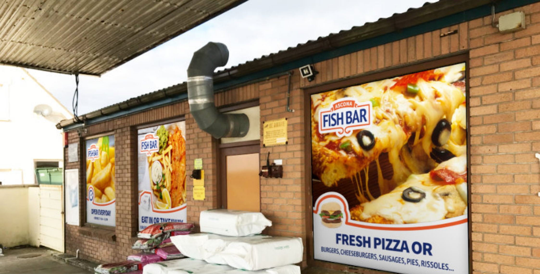
Pelcombe Service Station External Window Graphics.