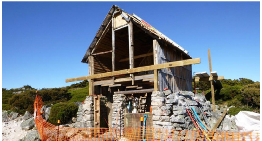
Restoration work in progress at Kitchen Hut

PWS is liaising with a community workgroup established to plan conservation works for the Old Pelion Hut centenary in 2016. Anyone with an