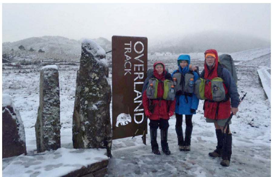
Walkers at the new departure point for the Overland Track.

"We've arrested and in fact turned around the environmental degradation that was occurring. Our campsite condition reports indicate that degradation has been stopped and campsites are now stable. As a result of the introduction of the one-way system and capped daily departures,