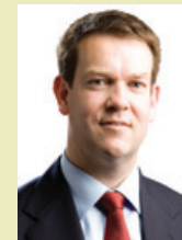
Minister Matthew Groom, Minister for Environment, Parks and Heritage

Our Government has a goal of increasing visitors to Tasmania by 50 per cent in