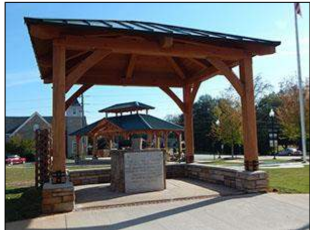
Loganville Town Green

The goals of the 2009-10 LCI were to develop a long-term vision for promoting growth within its downtown core, along US 78, and in nearby neighborhoods by promoting visual appeal, establishing a compatible mix of land uses, preserving local identity, ensuring multiple transportation options, reducing truck traffic, improving public safety, and supporting economic development.