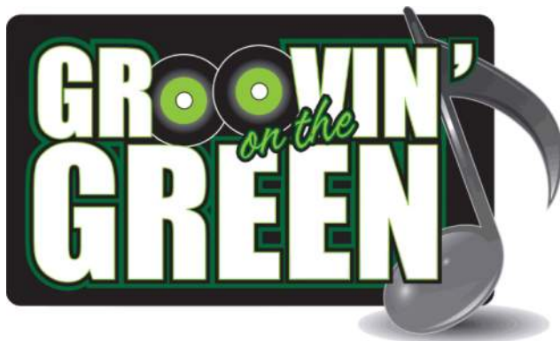
“Groovin’ on the Green” Concert Series

Since completing the LCI study, the City has made positive strides towards implementing the goals and objectives of the study. The City recently applied for LCI implementation funds for a bicycle and pedestrian facility improvements project along SR 81 / Lawrenceville Hwy, from Line Street to US 78. The City has dedicated resources to branding, marketing plans & materials, incentive programs for new investment, business support programming and numerous economic development avenues.