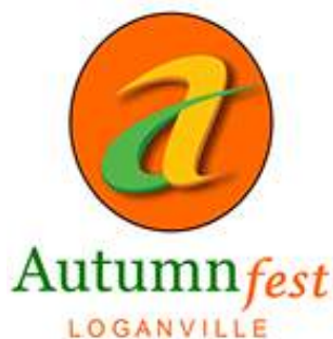
Annual "Autumn Fest"

conventions, weddings, etc., and construct the Loganville Town Green as a focal point of the downtown area. The Town Green is the site of "Movies on Main" and the "Groovin' on the Green" concert series.