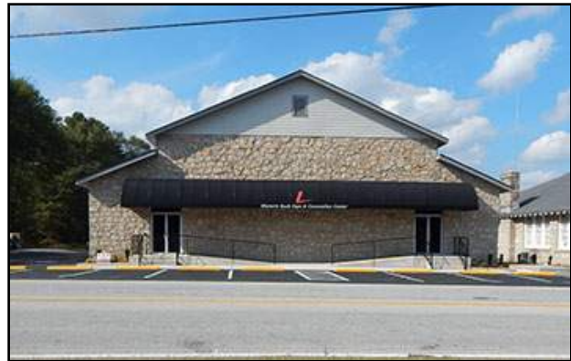
Historic Rock Gym & Convention Center

Since the 2009-10 LCI study the City of Loganville has completed several transportation related projects with several projects currently underway and nearing completion. These completed and underway transportation projects have been achieved in a variety of ways. Some are combined with public initiatives, such as new or upgraded infrastructure, to improve efficiency. The City Staff and consultant teams have worked closely with GDOT and the ARC to apply for project funding from a variety of available sources. In addition and where possible, the City has been diligent in monitoring private development to ensure that it does not occur in a way that precludes recommended transportation projects.