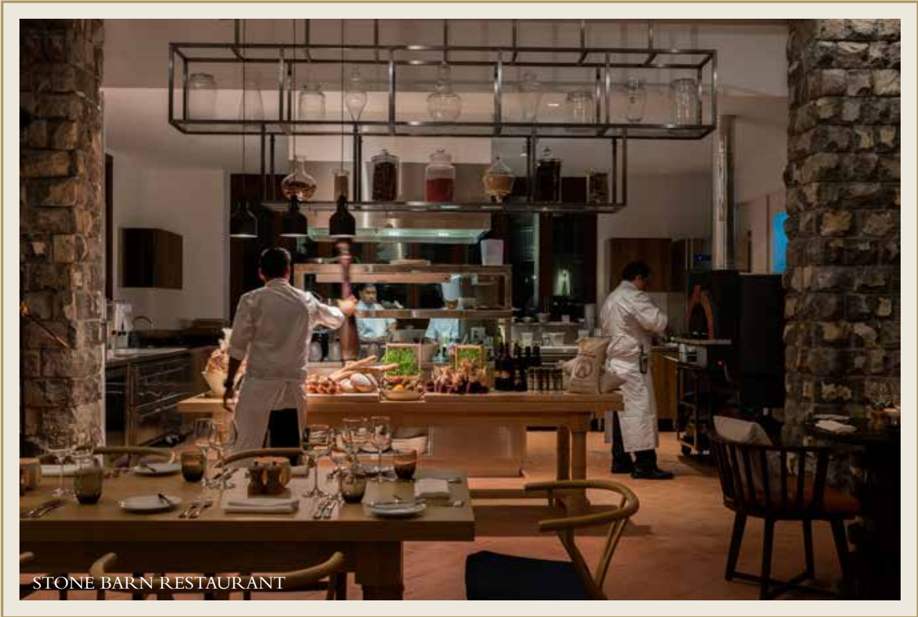
STONE BARN RESTAURANT