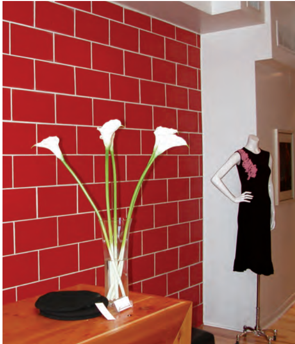
All images shown are Astra-Glaze Sw+®