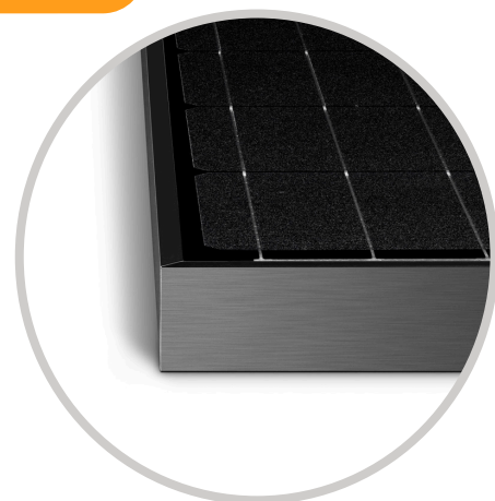
Silicon panels require heavy aluminum frames and ballasts.