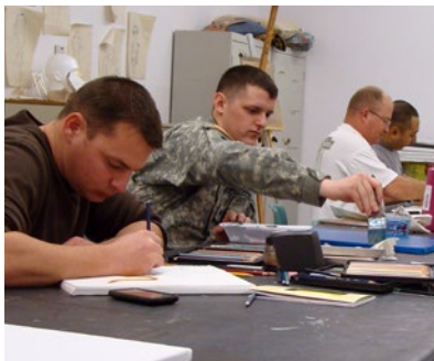
Participants in The Colorado Fine Arts Center's Military Healing Program.

The Fine Arts Center (FAC) has been offering Military Healing Programs for the Colorado Springs community since 2007. The programs are designed to educate the community about the power arts can have in the healing process through a variety of award-winning artistic courses for area Veterans and active-duty servicemembers and their families. Each year, work created in these courses is showcased in exhibits for the community. The FAC also provides military discounts for museums and theater as a Blue Star Program participant.