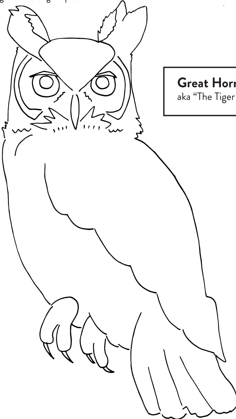
Great Horned Owl aka "The Tiger Owl"

Create your own camouflage creature! Look around your house and find a pattern on a pillow, blanket, rug or anything that catches your eye. Now, using the outlined animal below, try to mimic the pattern you found at home, and color the animal in that pattern. Once you're finished coloring, cut out your animal, put it on the item you copied, and see if your family can find your creature camouflaged against the original pattern.