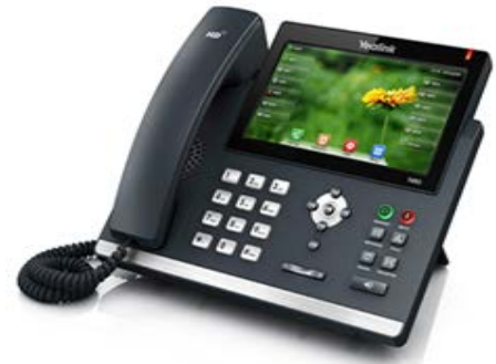
Yealink SIP T48G 16 line 29 key GigE Color

Communications Technologies, Inc features Yealink IP Phones to power your business. Yealink is known industry-wide for its superior voice quality, handset design, and overall value.