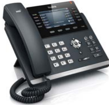
Yealink SIP T46G 12 line 27 key GigE Color