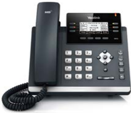
Yealink SIP T42G 12 line 15 key GigE