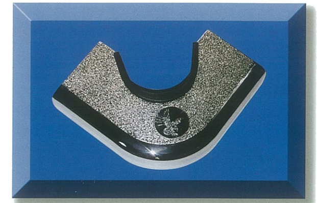
Stylish die cast reinforced, polished chrome-plated corners with Eagle logo, feature advanced screw in pocket liners for ease in replacement.