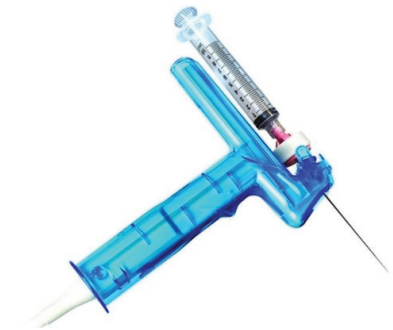
AxoTrack with Vertical Needle Technology