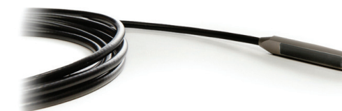
Surgical Small Parts Probe