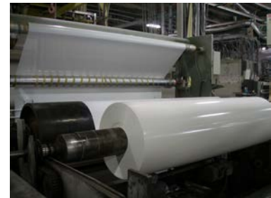
RP423BXW White tint version