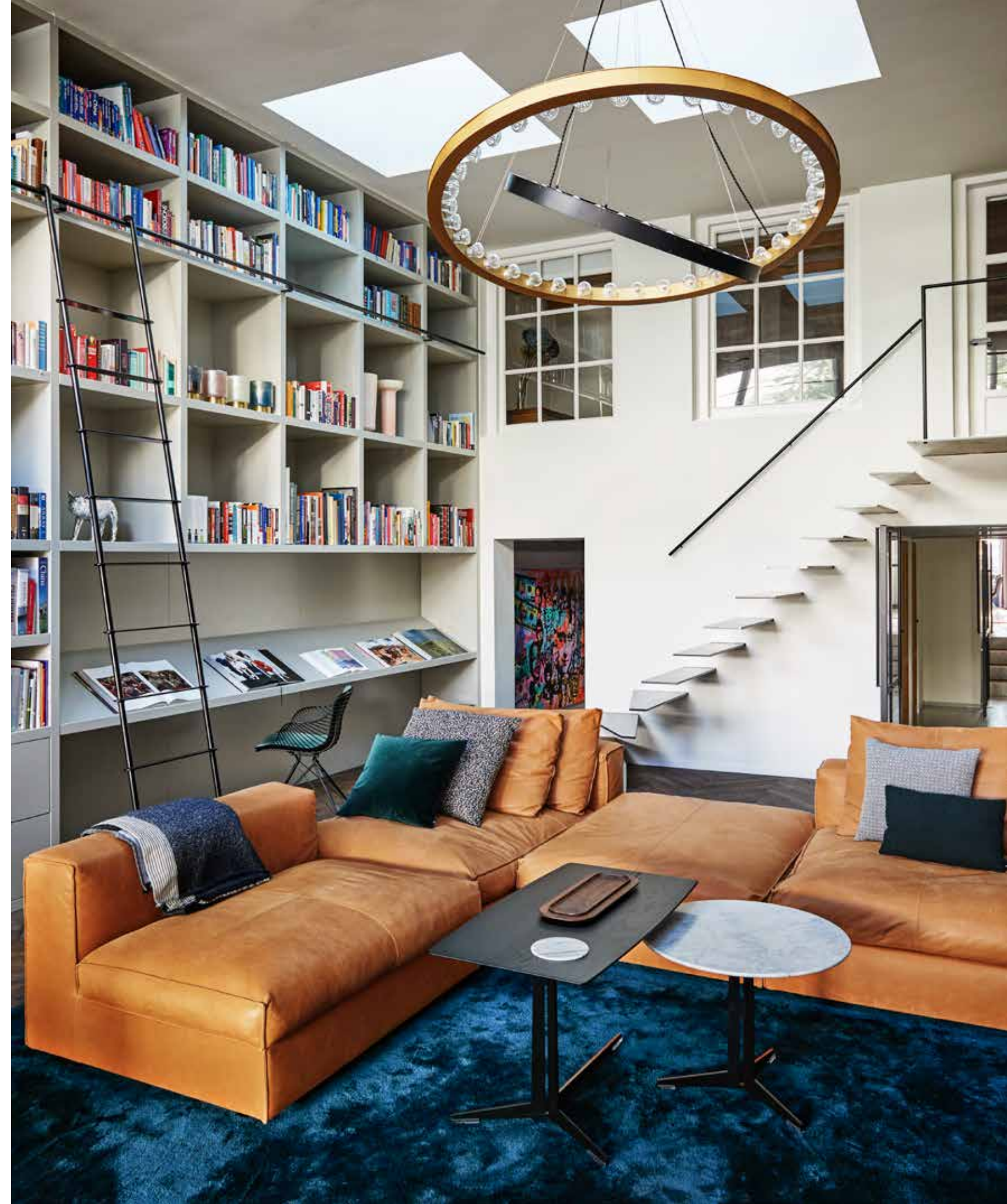
This page Bespoke wall cupboards and sideboard finished with smoked eucalyptus veneer