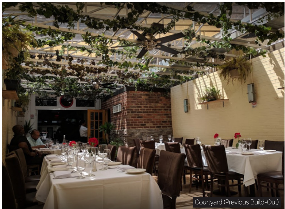
Courtyard (Previous Build-Out)