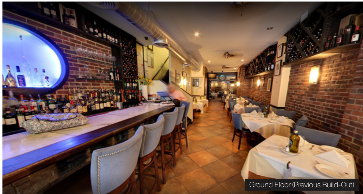
Ground Floor (Previous Build-Out)