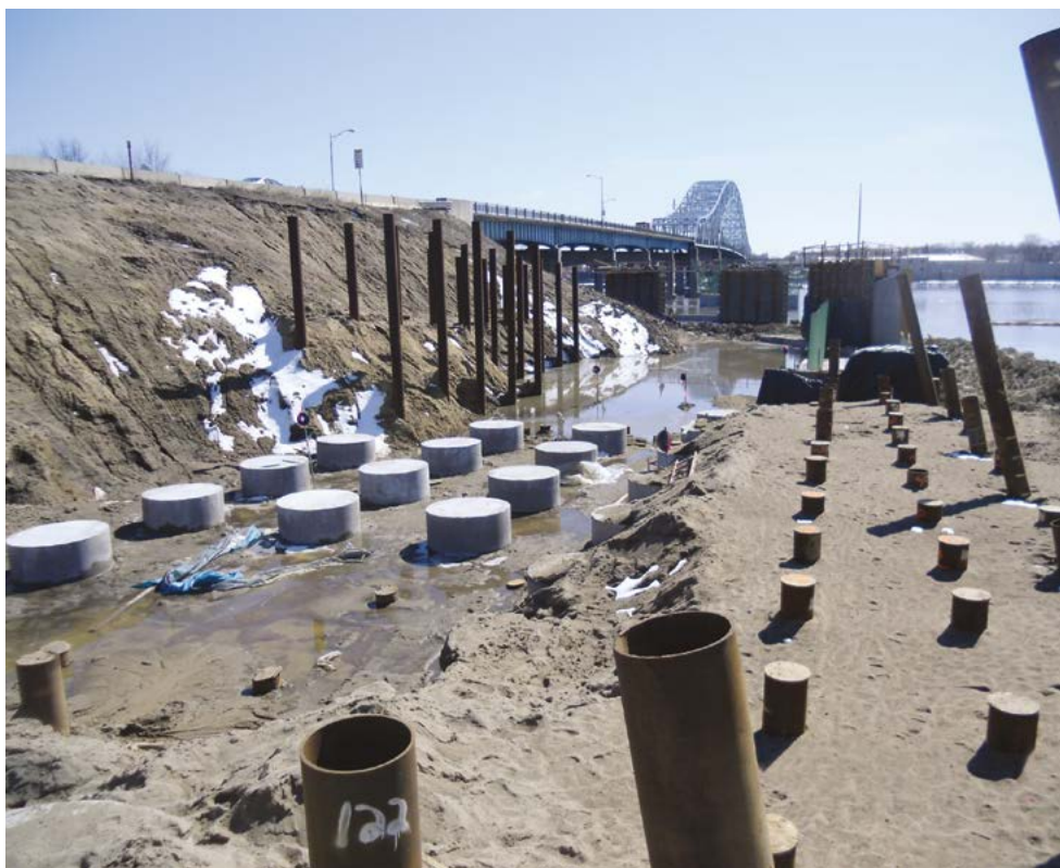
FIGURE 3 Some of the concrete pile caps (left side of photograph) and concrete filled pipe piles driven (right side of photograph) before construction of the LTP for the new bridge.