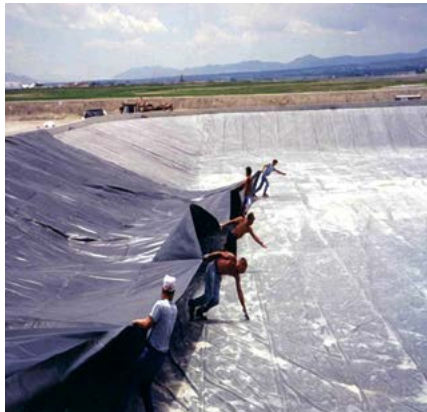
FIGURE 1 Deployment of a factory fabricated panel and floats installed in cover system for deicing fluid ponds at Salt Lake City International Airport.

A heavily traveled 11-km (7-mi) stretch of I-35 was constructed with a