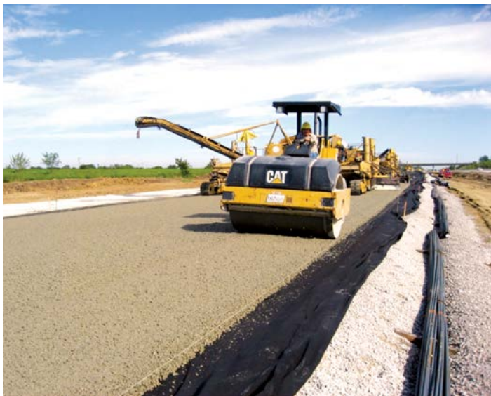
FIGURE 5 The CRCP rolled and overlaying the nonwoven geotextile separator and the geomembrane that provides the moisture barrier.

moisture barrier system to control the swelling and contraction of the underlying clays. The moisture barrier consists of, from pavement to the subgrade: