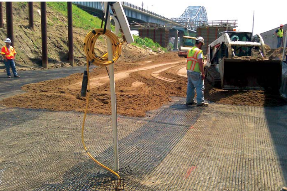
FIGURE 4 A layer of geogrid reinforcement is backfilled with fine sand to create the LTP for the new Hastings bridge approach.