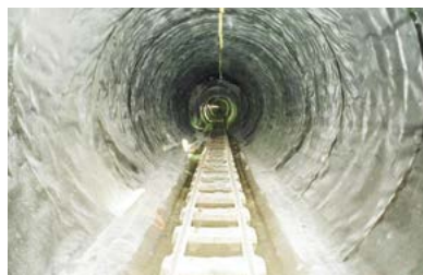
FIGURE 8 Field-seamed fabricated geomembrane panels used to create tunnel liner system.