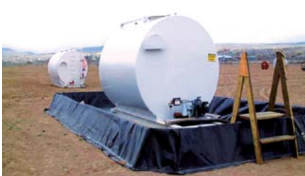
FIGURE 7 Geomembrane system used for temporary secondary containment of a fuel tank.