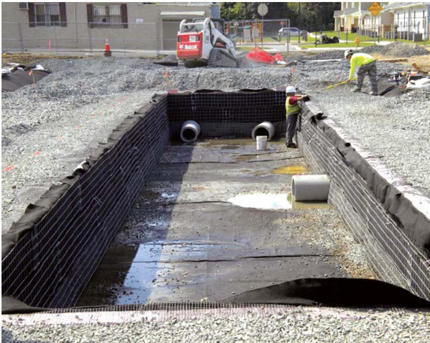
FIGURE 6 Construction of underground stormwater detention pond (Sheridan and Stark, 2010).

Frequently, geomembranes are used with geotextiles or a GCL as a leakage protection system (see Figure 8), facilitating construction and reducing the project time line. Because of urban space constraints, underground tunnels and