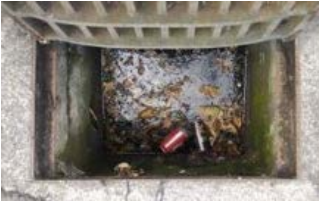
ROAD SIDE DRAIN

Below is a guide on how to monitor the LittaTrap, evaluate material caught and record the data.