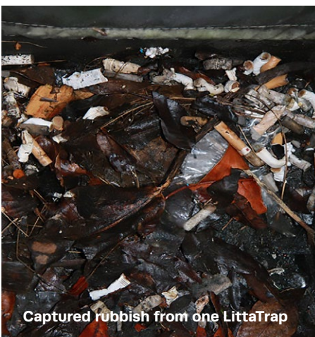
Captured rubbish from one LittaTrap