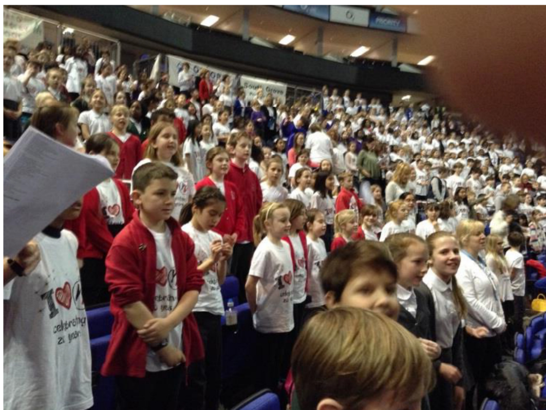
Young Voices Concert at the O2

Schools may legally request voluntary contributions in support of school activities such as educational visits. However, there is no obligation for parents to pay, and no pupil is ever excluded from taking part if their parent has not contributed. However, if sufficient voluntary contributions are not received from parents for the activity then it may have to be cancelled for all pupils.